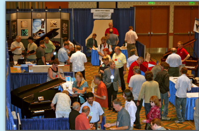
EXHIBIT HALL SCHEDULE